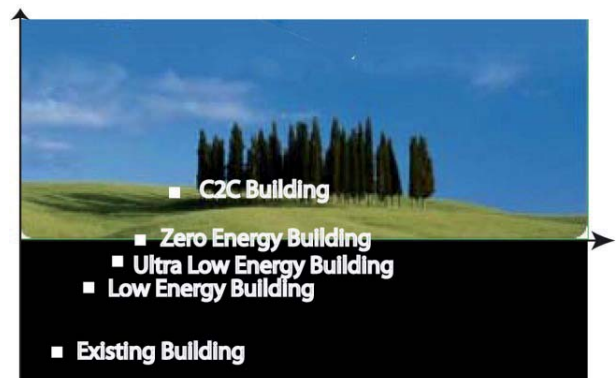
Figure 2: clear line drawings are essential

A cradle to cradle compatible net zero energy building seeks the highest efficiency in the management of combined resources and a maximum generation of renewable resources. The building's resource management emphasizes the viability of harnessing renewable resources and allows energy exchange and micro generation within urban boundaries.