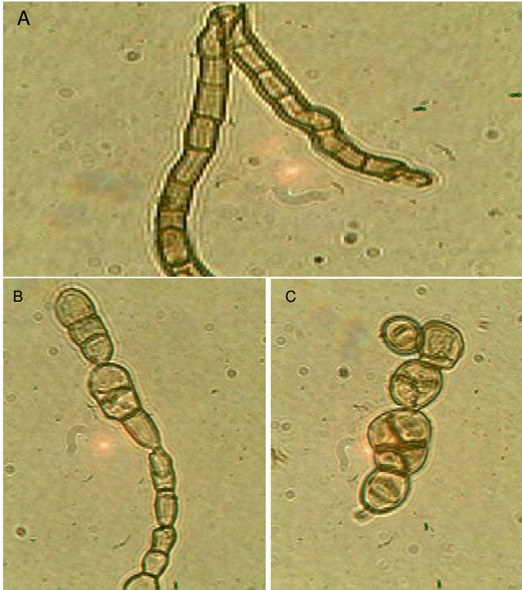
Figure 2. Alternaria jacinthicola . Septa mycelia (A) Conidiophore, (B) and Arrangement of conidia (C) and ex representatives of isolate Mlb684; from development of foliar disease and colony developed on V8 agar (100x magnification).

has been explored. Moreover, no analysis of this isolate Mlb684 phylogeny has ever been conducted. This work provides the first systematic examination of isolate Mlb684 as they relate to the hypothesized related taxa of Alternaria (Simmons, 1992). Moreover, it should be noted that some Alternaria species were already shown to infect water hyacinth and have been assessed as potential biocontrol agents against this weed. These are A. eichhorniae in Egypt (Shabana, 2005) and A. alternata in India (El-Morsy et al., 2006; Babu et al., 2003) which caused severe disease on the plant in greenhouse test conditions. Genetic comparisons of Alternaria sp. isolate Mlb684 with DNA sequences from these Alternaria