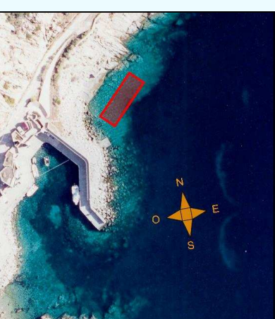
Figure 1. Paracentrotus lividus (1)

Corresponding author: Jonathan.Richir@ulg.ac.be