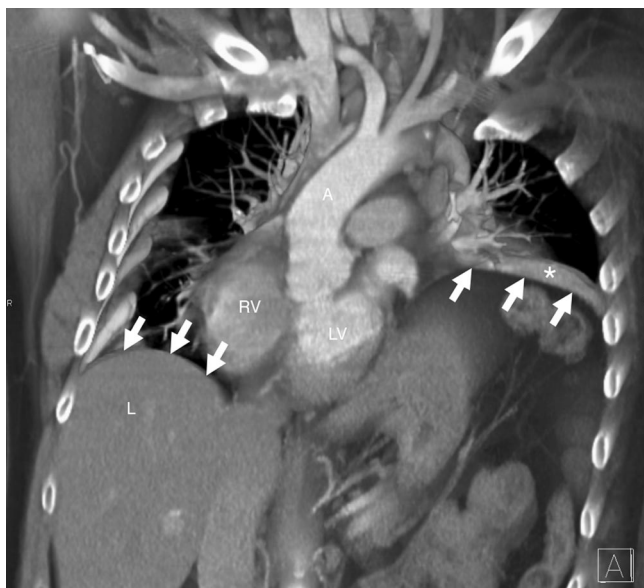
Fig. 2. Computerized, contrast-enhanced, multisliced tomography; coronary reconstruction. White arrows mark the right and left diaphragm; left side elevated diaphragmatic dome with compression atelectasis (*). A = aorta; L = liver; LV = left ventricle; RV = right ventricle.

MN) 8 months previously, he experienced intractable neuropathic pain, including deafferentation pain at the left upper limb, and tactile allodynia at the left chest after a coagulation of the dorsal root entry zone of the substantia gelatinosa (DREZ lesion) 1 yr ago. At time of presentation, the medication included 75 mg amitriptyline, 1,800 mg gabapentin, and an intrathecal infusion of 4 mg morphine per day since 1 yr. The pain relief was insufficient, with a mean pain level of 7 on a numeric rating scale (0–10). In addition, the patient reported increasing dyspnea, severe fatigue, sleep disorder, and depressed mood during the past 8 months. He was unable to walk more than 10 m, he needed permanent administration of oxygen, and partly assisted ventilation (continuous positive airway pressure) became necessary during the past 6 months. The medical and