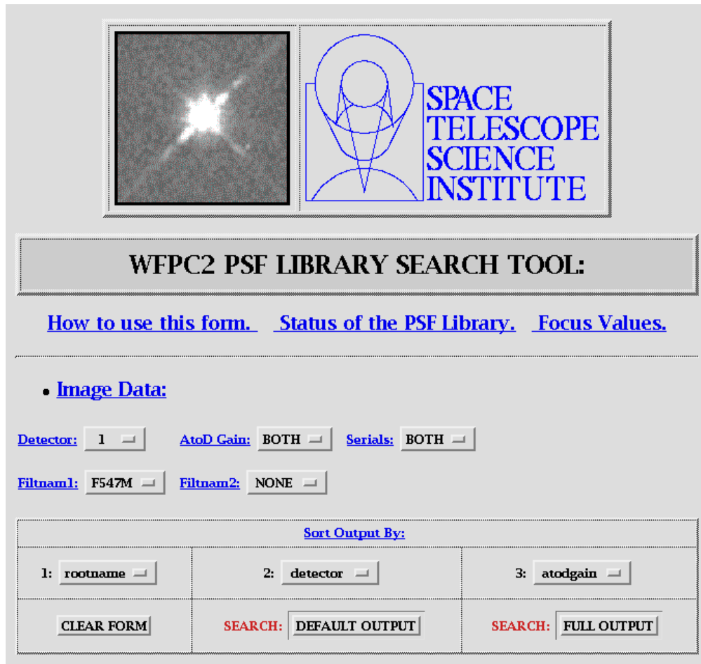
Figure 2. A portion of the WFPC2 PSF Library Web Page.

Figure 2 displays a portion of the PSF page, with parameters set to search for all PSFs for filter F547M, in the PC, with any gain, and both serials. There are many other key-words that can be used as qualifiers, such as observation date, exposure time, if the PSF is saturated, peak intensity, X,Y position (with search radius), as well as jitter. The user can sort the output according to any criteria, in this example the output will be sorted by dataset name, detector, and gain. The result of this search is in the “default output” format and is illustrated in Figure 3.