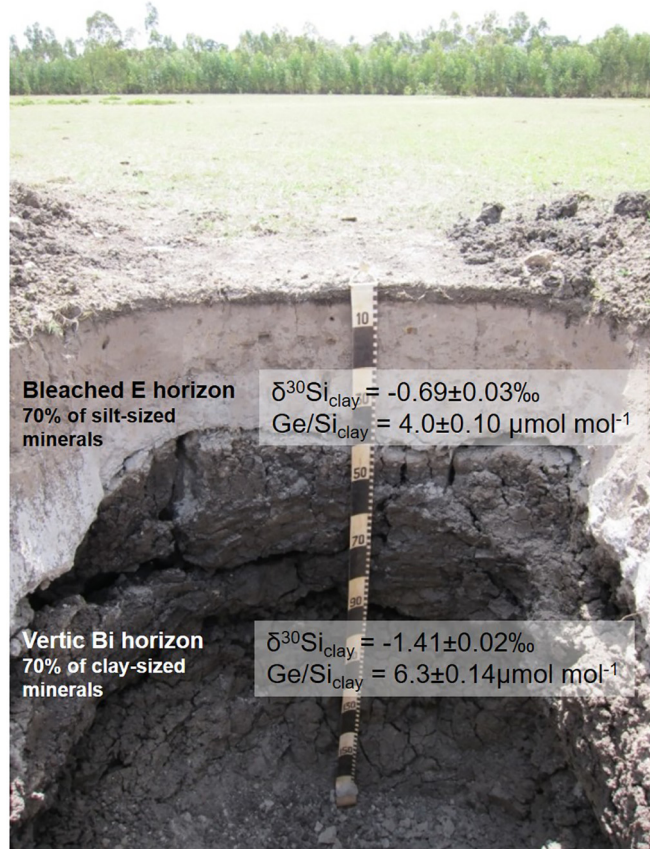
Fig. 3. Soil profile picture presenting the silty E horizon and clayey Bi horizon with their respective Si isotope signature and Ge/Si ratio in the clay fraction.

fraction is partly controlled by ongoing process affecting clay mineral formation/dissolution.