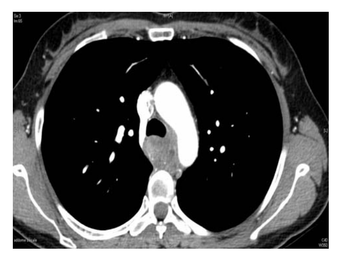
Figure 2. Chest scan: mediastinal lymph node metastasis.