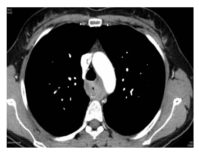
Figure 1. Chest scan: stenotic esophagus.