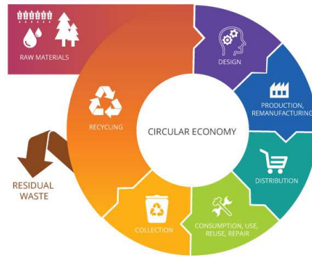
Figure 1. Schematic representation of the circular economy of materials and manufactured goods.