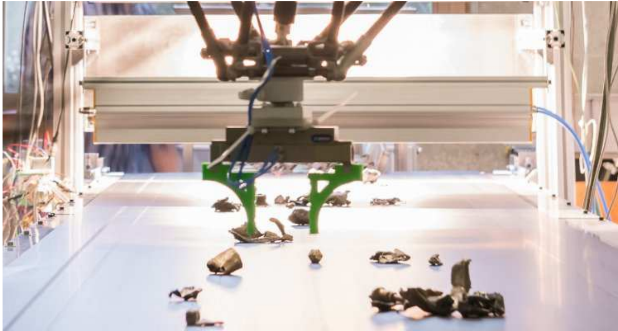
Figure 4. Prototype of intelligent sorting technology developed by ULg_GeMMe.

that can be computed in real time are still far away from the more advanced indicators accessible through the microscopy of sections, they can be very useful to develop pre-sorting technologies (separate barren from mineralized) or to perform cherry picking of high-valued materials. Moreover modern technologies allow separating into multiple bins whose bulk properties can be optimized in terms of value and volume to satisfy the market demand. As an example, the University of Liège is currently developing an intelligent sorting system to sort a complex mix of non-ferrous alloys and optimize their binning into populations corresponding to marketable alloy compositions (Fig.4).