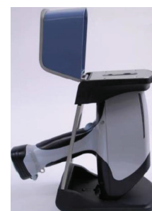
XRF (S1 Titan 600, Bruker) in desktop configuration