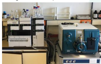
Figure 1: Qtrap 6500