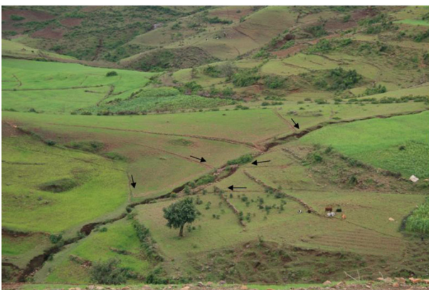
Figure 2. Slightly slanted drainage ditches on cropland drain surface runoff towards a main drainage ditch running downslope (diagonally through the photograph) and hence induce gully erosion. Direction of flow in the drainage ditches is indicated by arrows. Farmers make use of both drainage ditches and stone bunds (Wanzaye, Ethiopia, Aug. 2013). This figure is available in colour online at http://wileyonlinelibrary.com/journal/ldr .

Holden et al. (2004) studied the impact of peat drainage and concluded that wetland soils suffer from severe degradation due to ditches that can quickly erode deeply. Incised drainage ditches allow higher peak flows and are very dynamic, while they dissipate little flow energy (Simon & Rinaldi, 2006). Ditch degradation and widening over time are the undesirable effects (Alt et al. , 2009; Simon & Rinaldi, 2006) (Figure 2). To avoid ditches developing into gullies, farmers will yearly change their position (Shiferaw, 2002; Million, 1996).