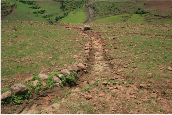
Figure 4. Bedrock exposure by gully erosion due to the construction of a feses drainage ditch construction in cropland near Wanzaye, Ethiopia (August 2013). In the background, another gully has cut the soil down to the bedrock. This figure is available in colour online at http://wileyonlinelibrary.com/journal/ldr .