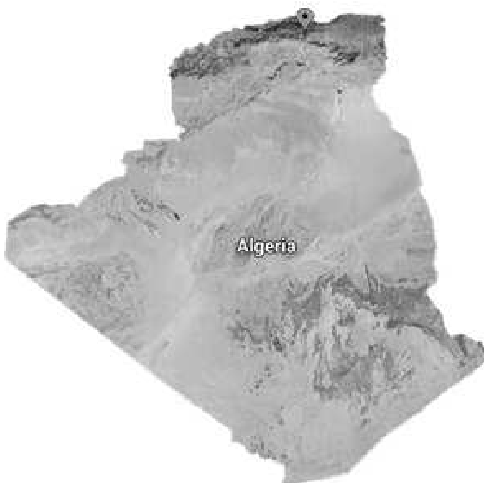
Figure 1. Location of the region of Chemini and Bouzeguene, Algeria