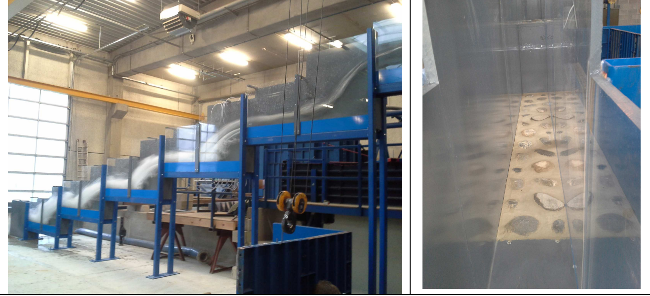
Figure 1: View of the physical model

To study the aeration process on the weir, it is necessary to remove the oxygen from the upstream water. As the water supply system of the laboratory is a closed loop, it is necessary to remove the dissolved oxygen from the water stored in the reservoir and the duration of a test is directly linked to the available water volume and to the discharge. Chemical dissolved oxygen removal technique has been applied. Given the limited width of the model and the available water volume, it has been possible to perform tens of minutes long tests with 4 successive discharge levels (25, 50, 75 and 100 m<sup>3</sup>/s on the prototype). The maximum discharge in the physical model was 127.5 l/s.