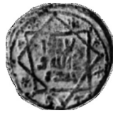
two intersected squares inside a linear circle with 8 pointed stars