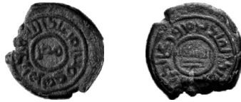
Zeno, #117905 (Fuṣṭāt/Miṣr)