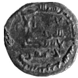
double linear circle