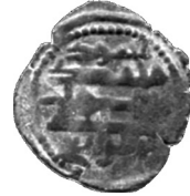
linear circle (beaded; linear)

لا اله الا الله وحده لا شريك له المنتصر بالله