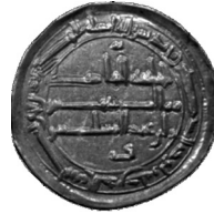
double linear circle, five annulets (o)

بسم الله ضرب هذا الدرهم بافريقية سنة سبعين ومئة