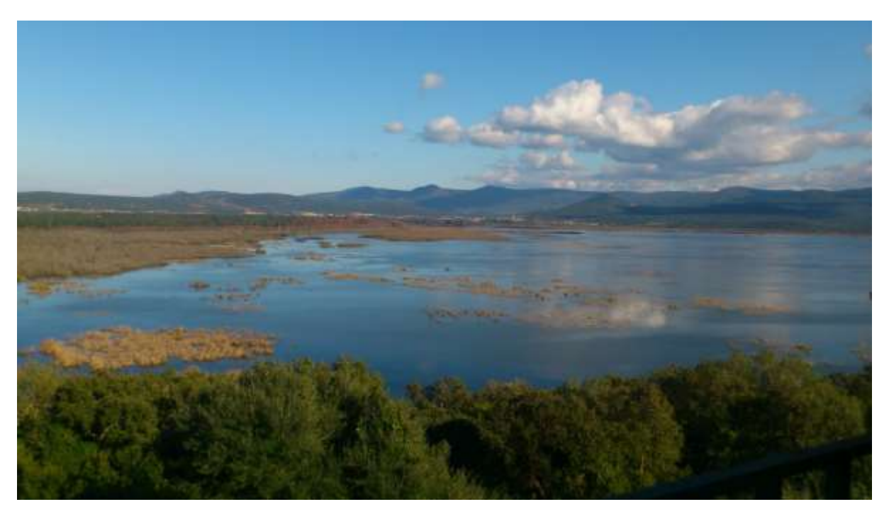
Figure 1. Tonga Lake, a freshwater marsh within the El-Kala National Park, Algeria.

The survey was conducted in surrounding area of Tonga Lake (Figure 1), which is situated in the extreme north east of Algeria (36°52′ N, 8°31′ E) (Figure 2). A freshwater Lake of 2 400 ha with a maximum depth of 2.5 m. This Lake have an international importance under the Ramsar Convention in 1983 and a part of the larger El-Kala wetland system, which is generally, recognized as one of the four major wetland complexes in the Western Mediterranean, this seasonal freshwater Lake is linked to the Mediterranean Sea [15; 16]. The Tonga Lake area was investigated in part because of the high diversity of potential breeding areas for mosquitoes (many wetland types) and proximity of these breeding sites to relatively dense human populations and other hosts including migratory birds.