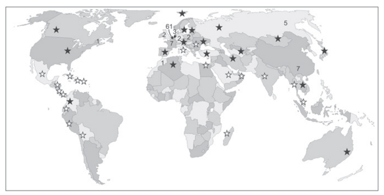
Figure 1. World Map of Edouard Poty's publications and collections. Cyphers indicate the number of publications for each country. Black stars stand for Palaeozoic corals from Eddy's collection. White stars stand for other corals from his collection.

field geologist who enjoys describing, measuring and sampling sections. Very few outcrops escaped to his hammer in Belgium and abroad. Step by step and country after country, he gathered what was going to be one of the largest - if not the largest collection of Carboniferous corals worldwide with more than 20 heavy cubic-metres of hand-specimens and 30,000 thin sections (and an unknown number of unclassified ones) from more than 60 regions (Fig. 1), each sample localized and stratigraphically positioned. Hundreds of those samples are rare specimens or specimens from localities that are no longer accessible and thus making this collection even more valuable. Thanks to many worldwide collaborations - several being running for more than 40 years on - Eddy gathered an incredible knowledge on the Carboniferous of the world. In 2015, his research on corals was rewarded by the highest prize in this field: the Henry Milne Edwards Medals from the Association for the Study of Fossil Cnidaria and Porifera.