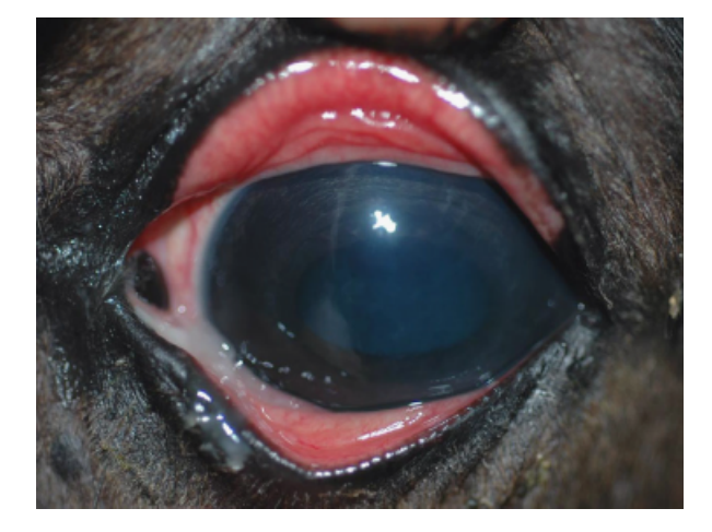
Fig 1. Mild anterior uveitis in a septic/nonbacteremic neonatal foal. Conjunctival congestion is associated with seromucous secretion, mild corneal edema, and aqueous flare.

remainder bacteremic/uveal-affected animals (n = 5), different bacteria were isolated, such as Klebsiella pneumoniae , Alcaligenes faecalis , Plesiomonas shigelloides , Citrobacter youngae , and Pasteurella spp.