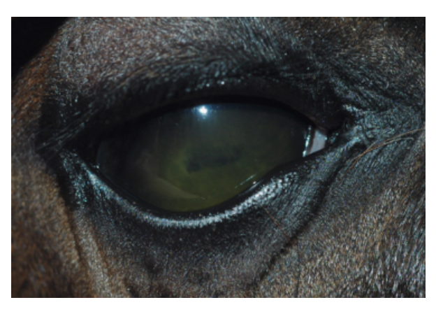
Fig 3. Severe anterior uveitis in a septic/bacteremic newborn foal. The anterior chamber is full of cells and fibrin, preventing the fundus examination.

and 27% (19/71) in the septic group (Fisher's exact test, P < .001). Among the septic group, the case fatality rate was 30% in bacteremic foals (10/33) and 35% in nonbacteremic foals (9/26). In the bacteremic group, the case fatality rate in foals with anterior uveitis was 54% (7/13), while it was 15% in foals without anterior uveitis (3/20). In the septic/nonbacteremic group, the case fatality rate in foals with anterior uveitis. In the septic/bacteremic group, the case fatality rate in foals without anterior uveitis. In the septic/bacteremic group, the case fatality rate in foals with chorioretinitis was 83% (5/6), while it was 19% (5/26) in foals without posterior uveitis (fundus examination could not be performed in 1 septic bacteremic foal) (Table 3).