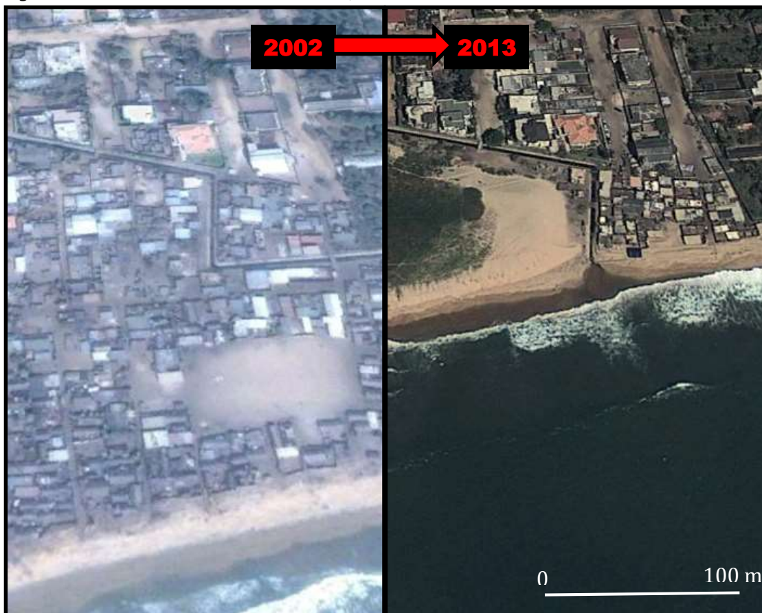
Figure 1. Coastal Erosion around Cotonou, 2002–13

In some zones, a progressive replacement of parceled or standing houses by makeshift houses between 2002 and 2011 can be observed. Furthermore, between 2011 and 2013 images reveal a rapid destruction of some of these newly constructed houses.