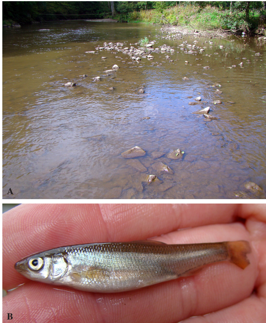
Figure 3. - A: Habitat where young of the year nases were captured in September 2011 in the River Amblève. B: Juvenile nase captured in September 2011.

As a first approach on rheophilic cyprinids, this preliminary test reveals that intra river translocation of adult individuals potentially operates and may be a credible way to accelerate a colonization process, if good quality spawning habitats are available. Translocation is simpler to implement than artificial hatching, that requires important infrastructures and human resources, and may be an alternative when downstream populations are still abundant. However, as translocations may have adverse consequences if basic rules are not followed (Maitland and Lyle, 1992; Maitland, 1995), this technique cannot be considered without a well thought long-term restoration program at the scale of the entire river basin, a scientific monitoring of the restored populations and serious knowledge on the biology of the target species.