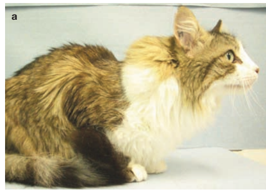
Figure 1 (a-c) Cats with feline injection-site sarcoma.

FISSs are usually firm, indolent, seemingly wellcircumscribed, subcutaneous masses that are often not freely moveable.