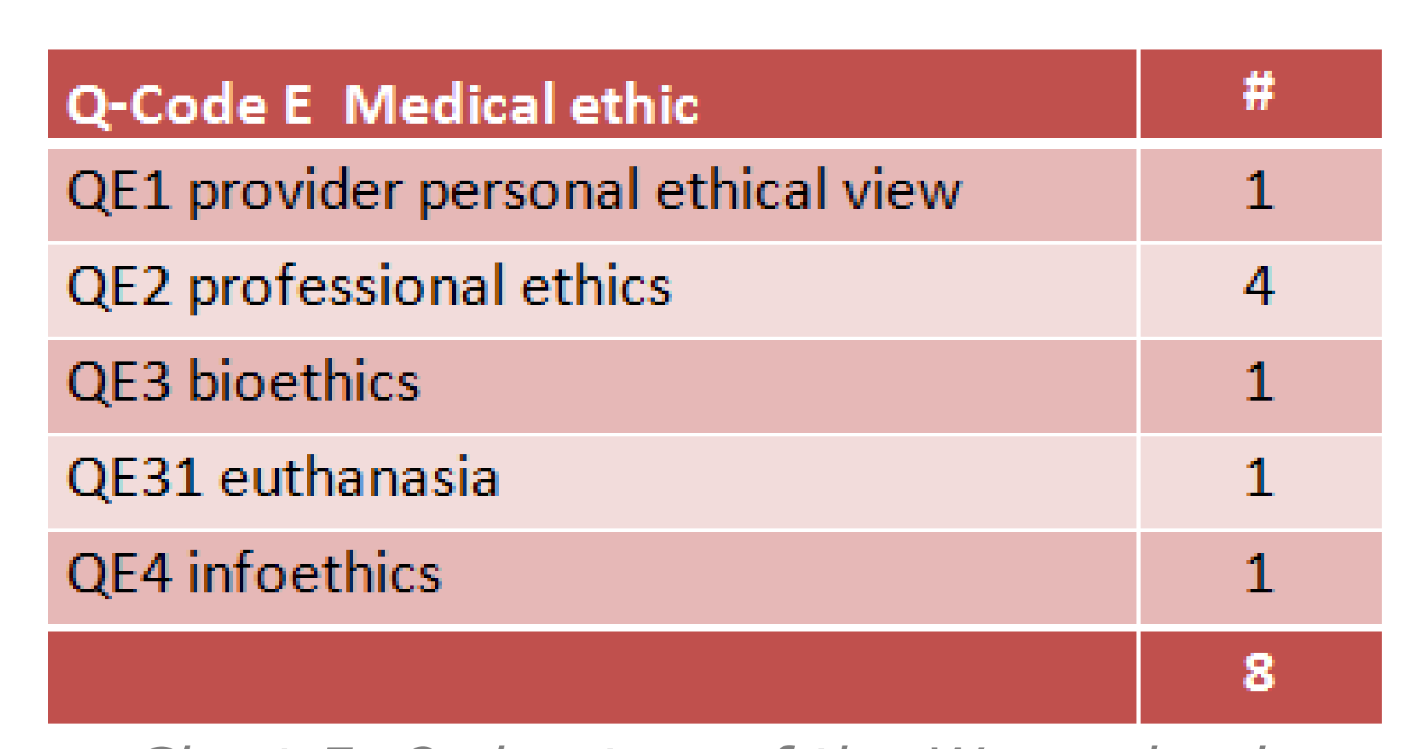
Chart 5: 8 chapters of the Wonca book 2015 are dealing with ethical issues