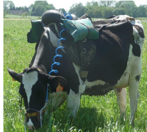
Fig. 2 : Device for collecting a sample of daily enteric CH 4 emissions