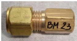
Fig. 1 : Bolus containing and emitting SF 6