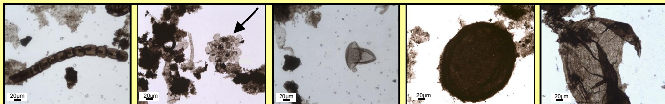
Fig. 2: Some typical species of the Mbuji-Mayi microbiota.

The diverse and well-preserved assemblage with 56 distinct taxa containing acritarchs, coccoids and filamentous forms, is similar to other coeval assemblages described worldwide outside of Africa. The presence of the acanthomorph acritarch Trachyhystichosphaera aimika is significant as it is indicative of the late Meso- to early Neoproterozoic age elsewhere, and is reported for the first time in Central Africa.