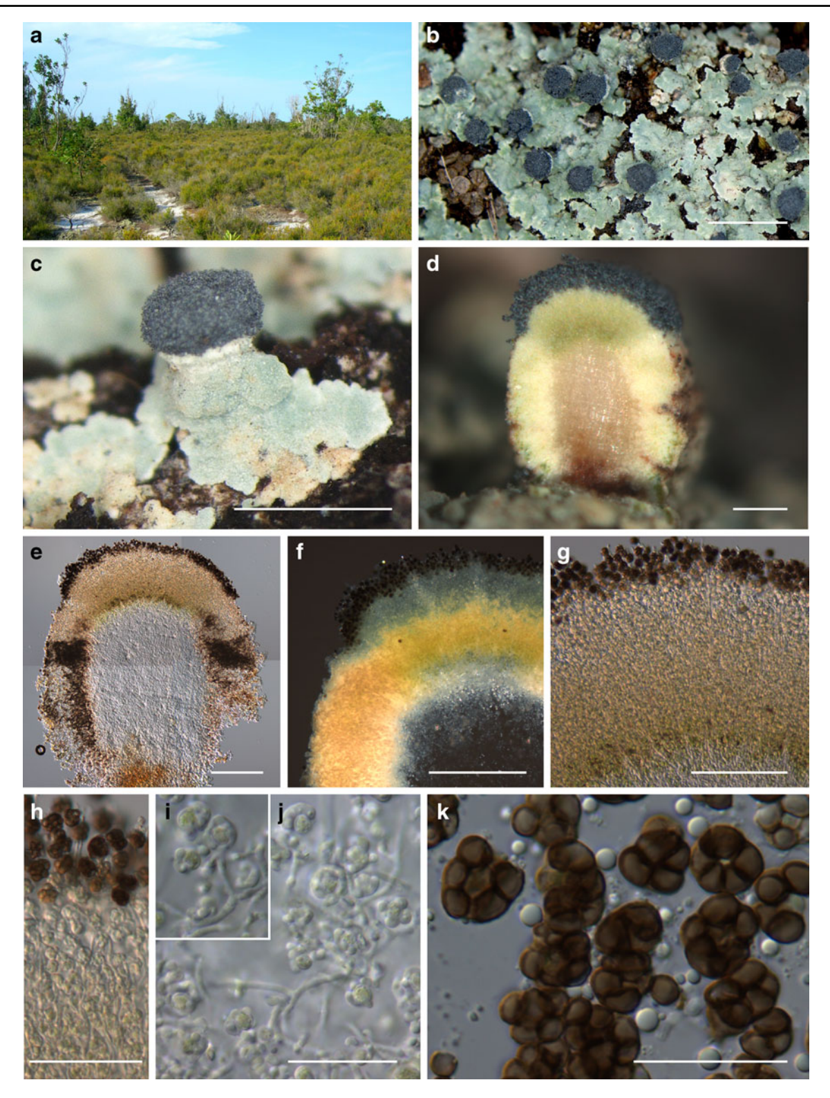
Fig. 3 Savoronala madagascariensis ( b , c isotype LG; d – k holotype). a Habitat, coastal heathland on dunes with Erica shrubs. b , c Thallus and sporodochia on stipes. d , e Section through a stipe and sporodochium ( e in KOH). f Section through the upper part of a stipe and sporodochium view in polarized light (in H2O). g , h Conidiogenesis