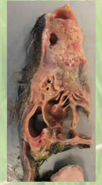
Fig.3: Transverse section of the muzzle showing necrotic tissue invading the frontal sinus (star).