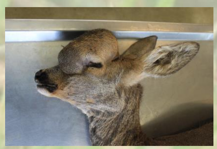
Fig.1: Picture of the head exhibiting an abnormal naso-frontal mass.