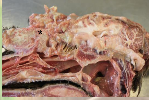
Fig.4: Longitudinal section of the skull displaying an infiltrative neoplastic mass (star) effacing the naso-maxillary bone.