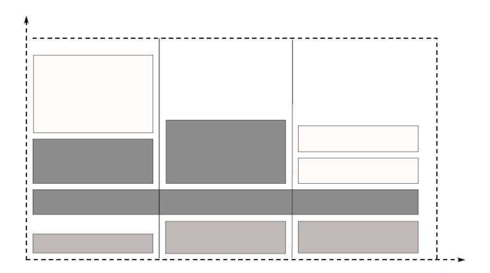
Fig. 2 Example of a multi-pile vehicle (figure adapted from [79])

in combination with maximum touching area, a least waste algorithm. Junqueira et al [61] solve the 3L-CVRP with an ILP in which they incorporate the 3D loading feasibility check.