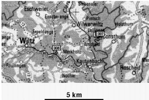
Figure 1. Location of the Merkholtz South-East quarry (008), SE of Wiltz, and of the Consthum “Rinnen” quarry (007), ENE of Wiltz, Luxembourg.

of a psammosteid heterostracan in the Schuttbourg Formation constitutes the second verified record of vertebrates in the Lower Devonian of Luxembourg, and the first record of psammosteids in the Ardenne Massif. This taxon is indeed well known in the Lower Devonian of England in the West, and in the Lower Devonian of Germany in the East, but surprisingly was unknown in the Ardenne Massif, both in Belgium and Luxembourg.