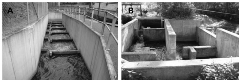
Figure 1: View of the two vertical slot fish passes studied: Lorcé on the Amblève (A); Berneau on the Berwinne (B)