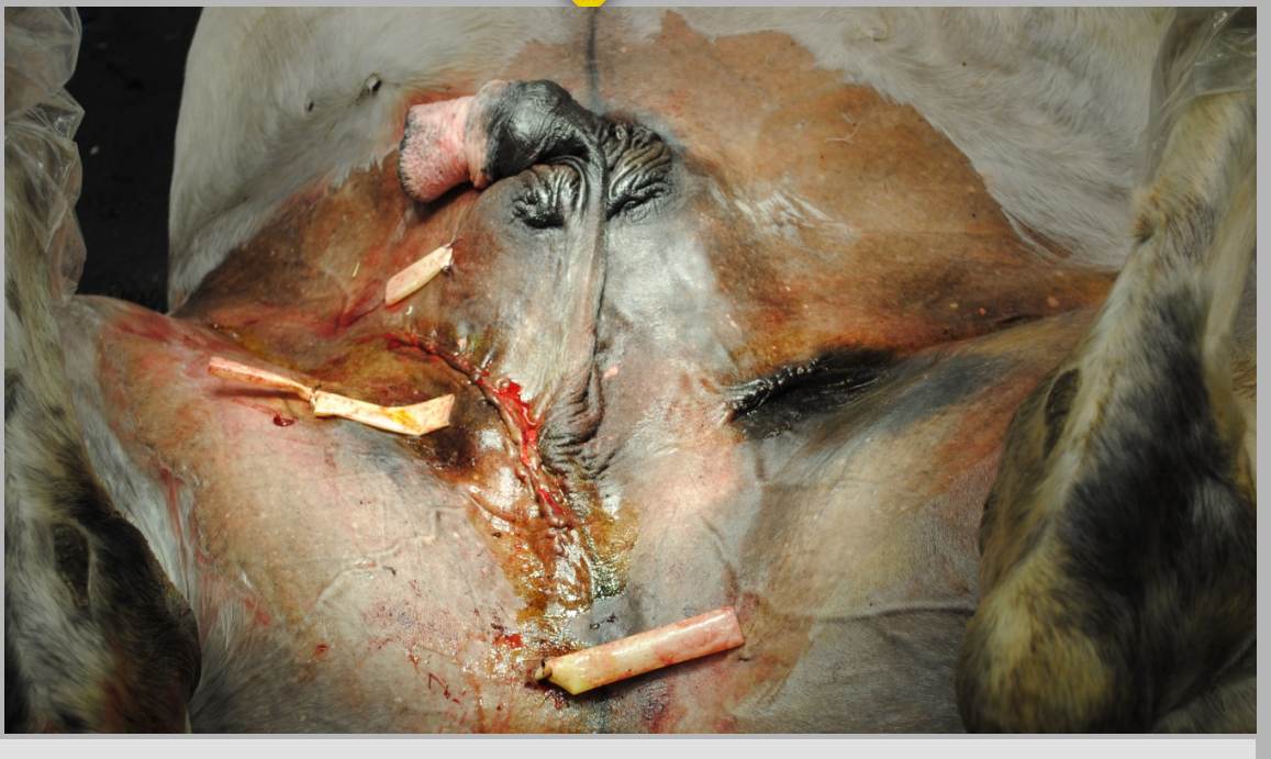
Subcutaneous drains were placed in case of the post-surgery very large dead space.