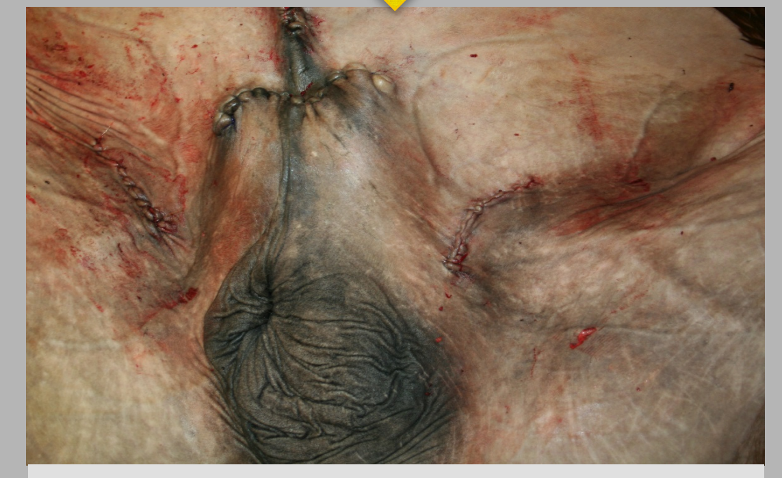
Subcutaneous tissues and skin were closed in a routine manner in all horses (Fig 11).