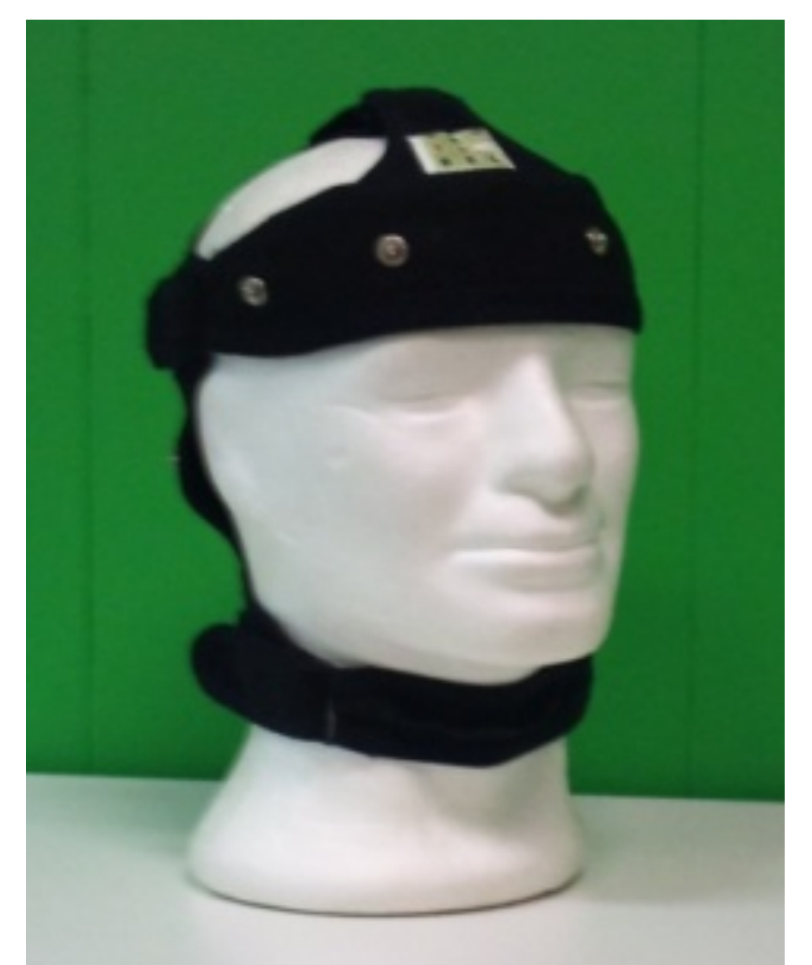
Final textile prototype. The miniaturized electronic part come to clip on the snaps.

This research was funded by a FIRST grant of the Walloon Region (DGO6)