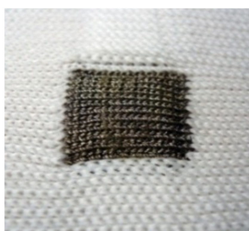
A simple textile electrode, composed of knitted silver fibers.

The key point of this project was the use textile electrodes made of silver coated polyamide fibers.