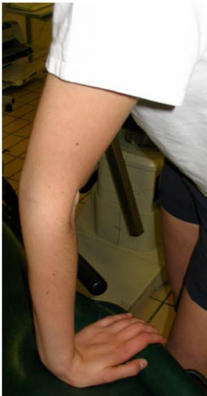
Figure 1: Elbow hyperextension of more than 10°.