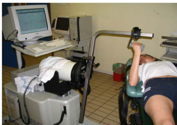
Figure 3: Rehabilitation of the hypermobility of the right elbow on the isokinetic dynamometer.

elbow), eccentric strengthening exercises at slow speeds, were carried out on an isokinetic dynamometer (Cybex Norm®) (Figure 3). Thus, she was trained to move her wrist at increasing speeds [30°/s, 60°/s, and 90°/s] within a limited range of motion in flexion and extension. All the more, as our purpose was to improve the gesture control, she started a submaximal eccentric program, using slow speeds, very gradually intensified (3 to 5 sets of 15 repetitions), in a safe range of motion in order to promote protective braking action of the joint.