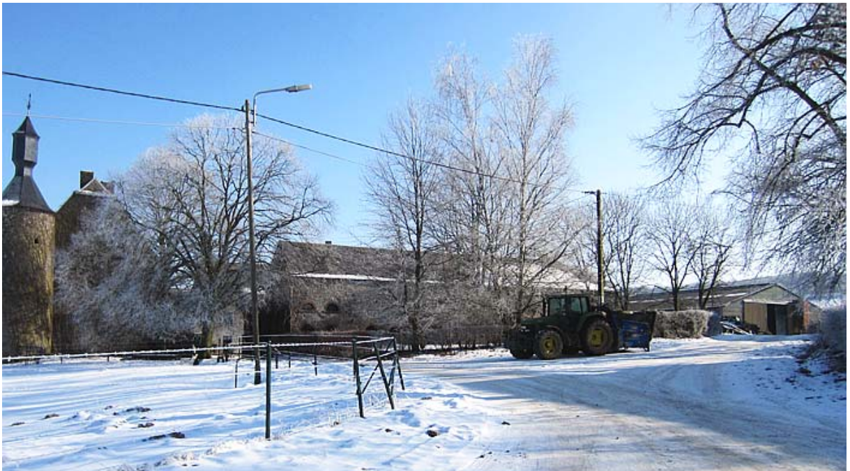
Fig 5. Walloon agritourist farm between Ciney and Marche-en-Famenne, Centre of Wallonia.

Agritourism has numerous definitions, and the links between farming and tourist activity are still being discussed. For the past 35 years, the sector has offered a more specialized supply where innovation allows an adaptation to particular geographical conditions. The wide assortment of agritourist possibilities in Wallonia speaks to both the diversity of the countryside and the creativity of farmers who tend to find a niche in the tourist and leisure sector.