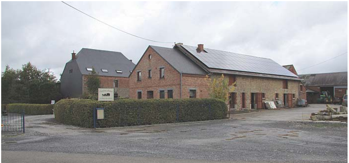
Fig 4. Walloon agritourist farm near Chimay, South-West of Belgium.

So, the nostalgic representation of agriculture and the desire for modern comforts lead to agritourist diversification that deviates from the appealing idea of valorising the working farm. Hence a share of the niche primarily devoted to farm tourism may be occupied by non-working farms. These non-working farms can more easily manage the nuisances of a working farm, create the illusion of being a farm and shape their buildings to tourists' expectations.