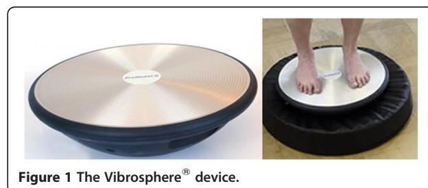
Figure 1 The Vibrosphere® device.

Four persons supervised the trainings: 2 physiotherapists and the first and third authors of this article. Once again, because of the spherical base of the device, supervision was necessary. Each training session was supervised by one of the supervisors. Some patients came to the training