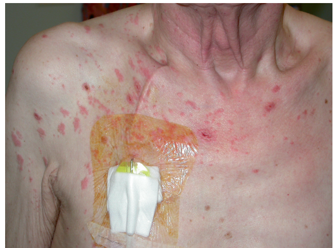
Fig. 1. Chronic herpes zoster duplex bilateralis of the right C4, T2 dermatomes.

A 70-year-old Caucasian man was diagnosed with chronic lymphocytic leukaemia (CLL) Binet grade B in 2003. Initial therapy consisted of chlorambucil and methylprednisolone. As there was no response, the patient was treated with 4 courses of fludarabine 40 mg/m 2 /day, with good clinical response. In 2006, a recurrence of CLL was treated with chlorambucil 5 mg/day. In 2009, bone marrow infiltration by a small cell lymphoma was observed. A biopsy from a lymphatic ganglion revealed CD5 + small cell CLL, IgM kappa + and a large proliferative centre. Proliferation estimated by Ki67 immunostaining was <20%. An aggressive transformation of the CLL was diagnosed (Richter syndrome). The patient developed HZ, simultaneously affecting the right C4, T2 dermatomes (Fig. 1) and the left L 1,2 dermatomes (Fig. 2). A major part of the dermatomes was affected. The lesions consisted of a small erythematous base with central vesiculation. Some lesions were pustular. Previously, the patient presented prodromal pains in the areas of skin involvement. The patient had no lymphadenopathies, fever or headache. A skin biopsy revealed intra-epidermal vesiculation with giant multinucleated cells and intranuclear inclusions, suggestive of an alpha-herpesvirus infection. Immunostainings with anti-VZV (anti-gE) (7), anti-HSV-I and anti-HSV-II antibodies (Dakopatts, Denmark) revealed positive marking for VZV (Fig. 3),