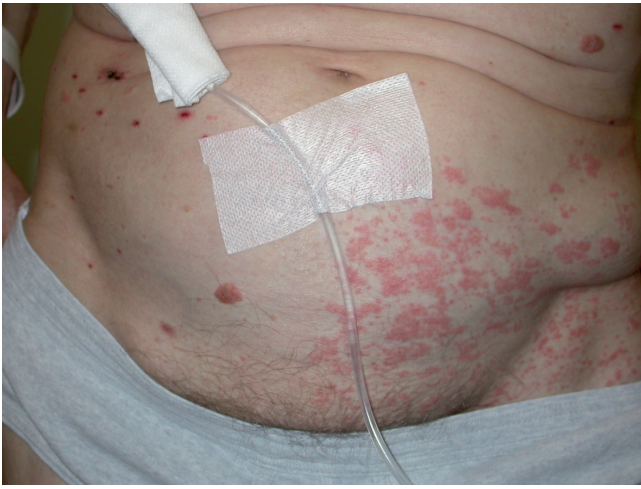
Fig. 2. Chronic herpes zoster duplex bilateralis of the left L 1, 2 dermatomes in the same patient.

whereas both anti-HSV antibodies were negative. Intravenous Aciclovir was initiated at 10 mg/kg/8 h. The vesicular and pustular lesions diminished, but, despite treatment, there was still no complete resolution after 15 days. A new skin biopsy still demonstrated positive VZV immunostaining. As no new vesicles developed, the patient was dismissed with oral aciclovir 800 mg 5 times/day. Two months later, the patient was again referred to the dermatology department. Clinical examination revealed a similar eruption to the one seen previously, affecting the same dermatomes. Additionally, he presented some satellite lesions beyond the previously involved dermatomes (Figs 1, 2). As aciclovir-resistance was suspected, the patient was hospitalized for intravenous aciclovir treatment at 10 mg/kg/8 h, or intravenous foscarnet. A viral culture for aciclovir-susceptibility testing was not performed, as the patient's general status deteriorated rapidly. A left basal bronchopneumonia developed with Staphylococcus aureus sepsis. Despite adequate intravenous