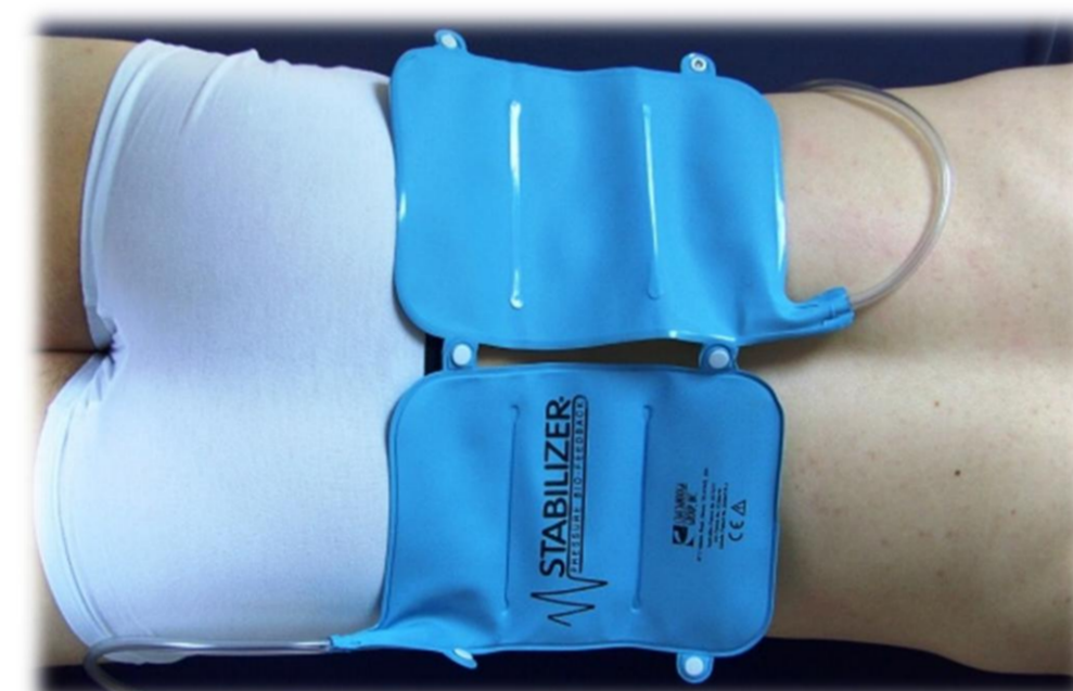
Figure 1: PBU positioning

The Bent Knee Fall Out (BKFO) test was used to assess the players' ability to control movement of lumbopelvic region. BKFO was performed in supine position and monitored by means of two pressure biofeedback units (PBU) inflated to 40 mmHg and positioned under the lumbar spine of the participant (figure 1).