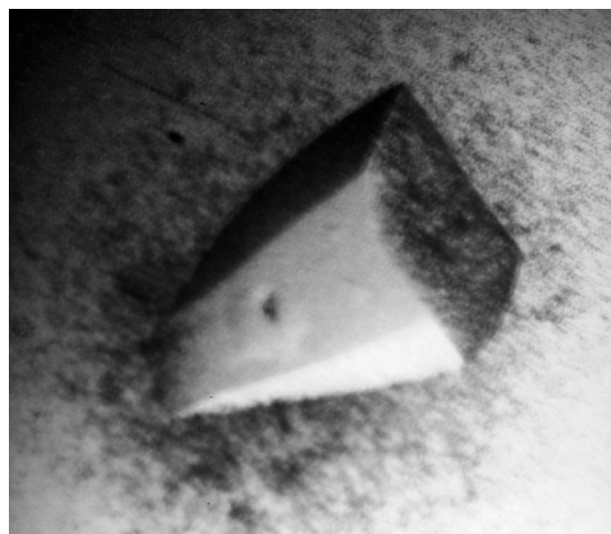
Figure 1 Micrograph of a DmpA crystal of form II. These crystals typically grew to a size of 0.9 \times 0.6 \times 0.5 \text{ mm} .

Heavy-atom screening was undertaken on form II crystals which are more reproducible, more easy to handle and do not deteriorate upon storage. Heavy-atom soaks were carried out at 294 K in reservoir solutions. One crystal was soaked in 10 mM parahydroxymercury sulfonic acid for 10 weeks. Difference Patterson synthesis, calculated using the CCP4 package (Collaborative Computational Project, Number 4, 1994), indicated six major Hg-binding sites in the asymmetric unit (Fig. 2). Six other sites could be subsequently identified using the difference Fourier technique. Initial refinement of coordinates and occupancies was performed with MLPHARE (Collaborative Computational Project, Number 4, 1994) leading to a Cullis R factor and a phasing power for centric reflections of 0.54 and 1.66, respectively. The six major binding sites have an occupancy between 2.2 and 1.54, while the six minor sites have an