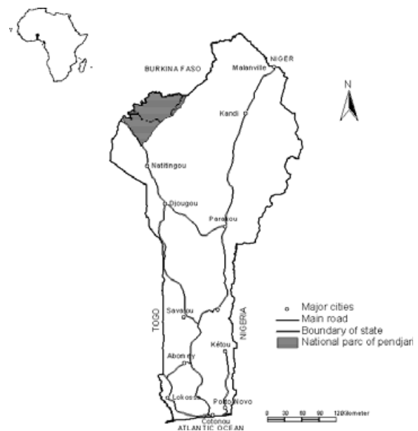
Fig 1 Study area location (National Park of Pendjari)

Under the pressure of the 'Harmattan winds' the Park gradually dries up from the end of the rainy season in October, with a peak in February and March. Meanwhile there are points of large ponds near the river (Tiabiga,