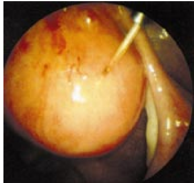
Figure 2. (a) Under laparoscopic control, the new fibre for interstitial thermo-therapy (ITT) is introduced into the myoma (b) endoscopic view: Myolysis is carried out using the bare fibre. The size of the myoma is 4.5cm.

The experience with cryomyolysis was limited to a prospective pilot study (Zreik et al. , 1998). A total of 14 patients were treated with a GnRH analogue for \geq 2 months to decrease myoma size, with magnetic resonance imaging (MRI) being performed initially to determine shrinkage of the uterus. A second MRI was carried out 4 months after surgery and discontinuation of the GnRH analogue therapy, when regrowth of the uterus to its original size would be expected.